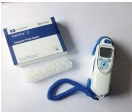
Tympanic thermometer and ear cuffs