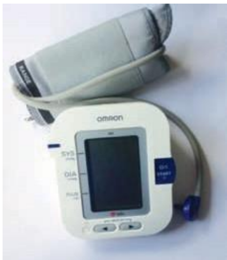
Electronic and manual BP machines

Having screening equipment available at each appointment/session is an important part of environment preparation and is advisable to enable flexibility and person-led appointments.