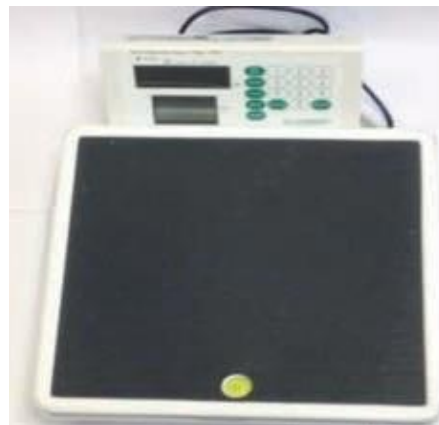
Scales with BMI indicator