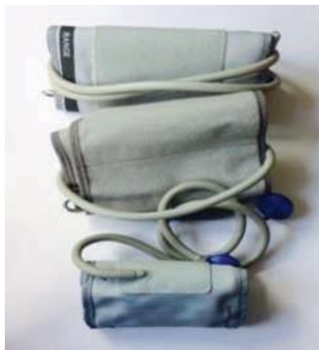
Different sizes of cuff